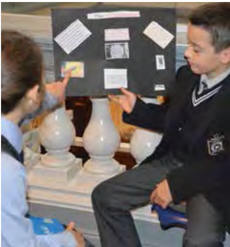
During Reconciliation Week, Years 3 and 5 students prepared presentations after completing research into our indigenous people's history and the effect of white settlement. Students particularly focussed on the referendum, the Mabo case and the apology. Aboriginal and Torres Strait Islander history and culture is a priority in the Australian curriculum and has many benefits.