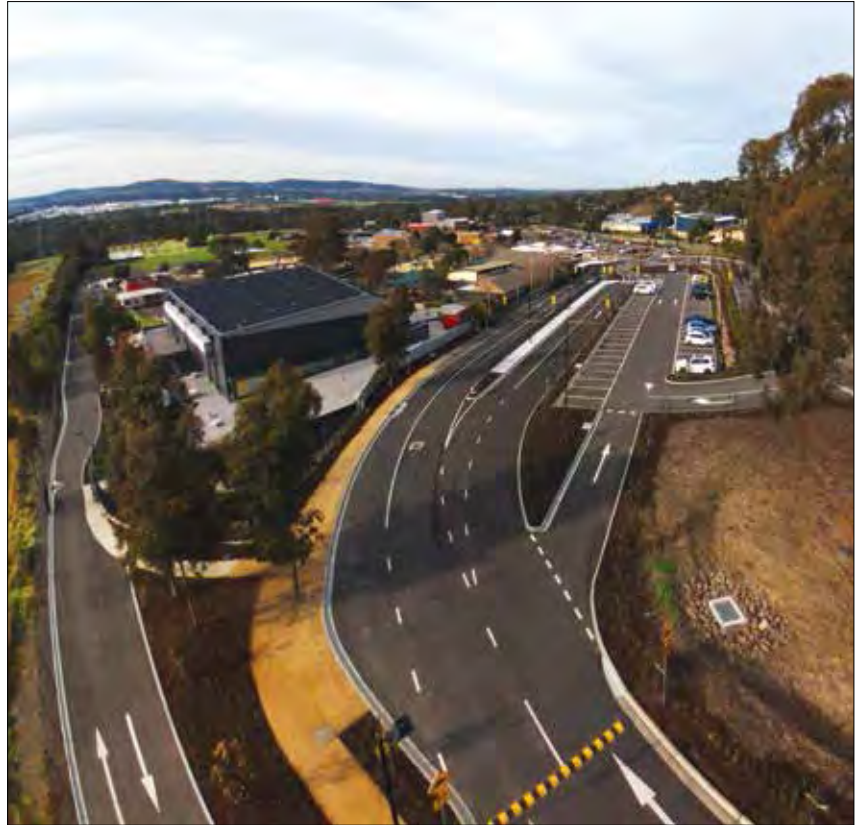
The roads and parking project at Wheeler's Hill Campus has addressed significant traffic issues.