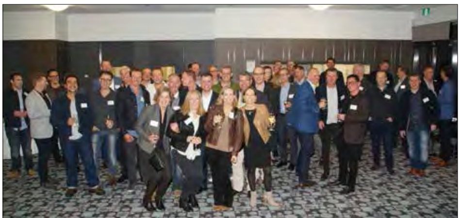
More than 50 members of the Class of 1987 enjoyed their 30-year reunion in the Lindsay Thompson Centre at Caulfield Campus on 19 May.