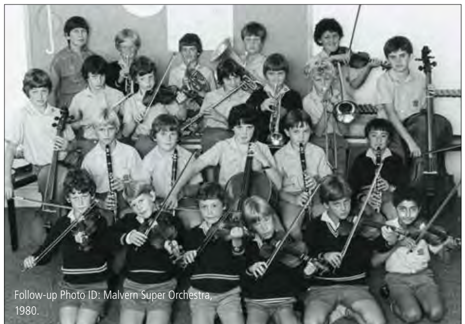
Follow-up Photo ID: Malvern Super Orchestra, 1980.