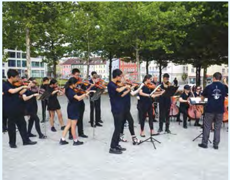
European Music Tour: Congratulations to our Kreisler Strings on their stunning performances, and our Chamber Strings ensemble who were awarded 4th place in the Vienna International Festival – an outstanding achievement!