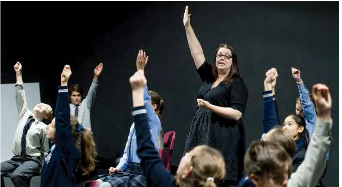
Year 7 Theatre Studies students recently investigated Ancient Greek Theatre and focussed on developing a Greek Chorus piece from Sophocles "Antigone". Students experimented with synchronised movement and elaborate gesture. As the Chorus traditionally narrates the story and offers the voice of the 'everyman', students were working on developing exaggerated movements and gestures that might be associated with a news room for newspaper journalists. Students played with these movements, put them into a pattern and gave them a rhythm accompanied by music to create the introduction to our Greek Chorus piece.