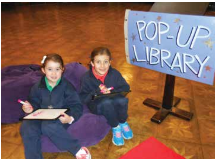
The pop-up library at Malvern Campus has been encouraging young readers.