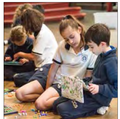
Year 5 and Year 1 coding buddies at work.

In the Year 1 cohort, we are also lucky enough to have a number of students who already speak Chinese at home. Playing games in native and non-native speaking partnerships, has helped to create a culture of support, where our Chinese speakers provide encouragement for our second language learners.