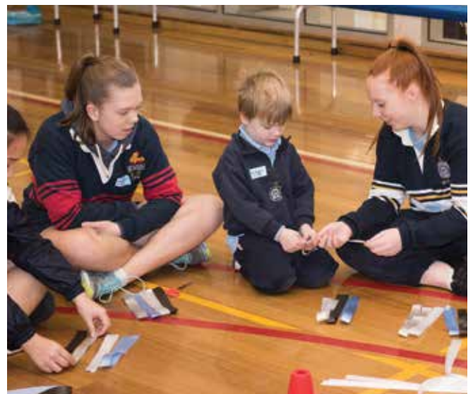
Building a community from the bottom up. Prep to Year 12 House activities at Wheelers Hill on 23 June.