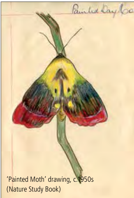
'Painted Moth' drawing, c.1950s (Nature Study Book)