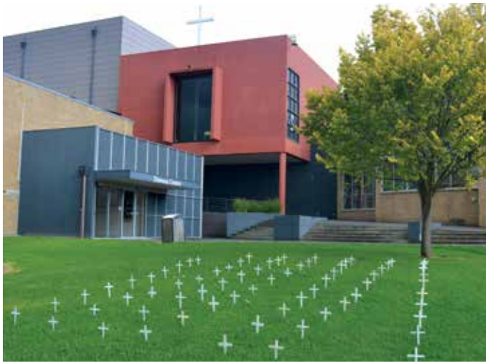
The Anzac Day observance at Wheeler's Hill Campus included an installation of white crosses to symbolise the number of Caulfield Grammar students who lost their lives in war. Students support the ANZAC Day service in the City of Monash.