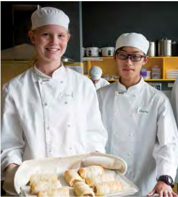
The final product! Beautiful sausage rolls and well skilled Year 9 students in the VET Hospitality course.