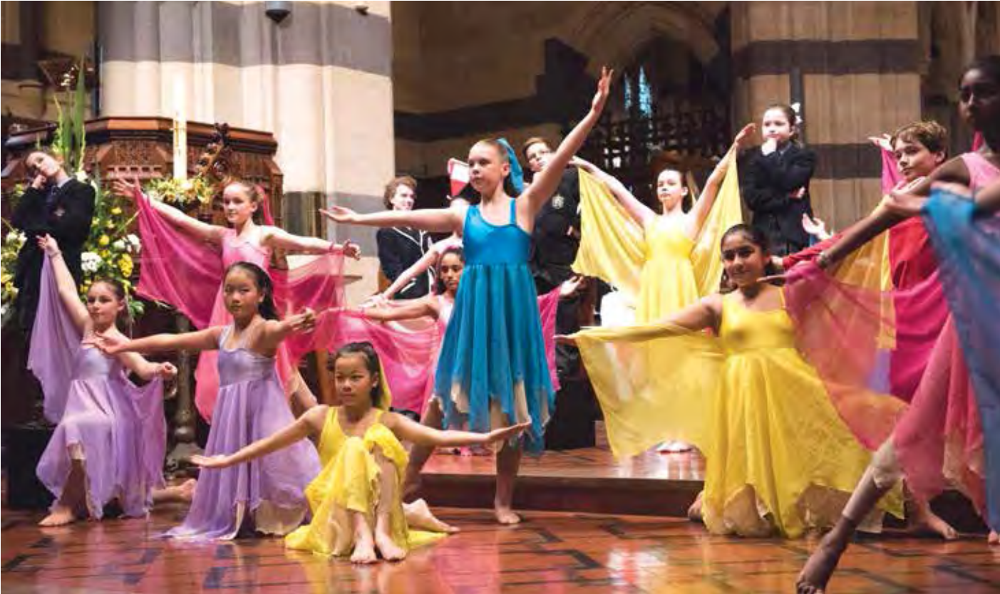
The theme of 'wonder' was explored at the 2017 Founder's service on Sunday 30 April at St Paul's Cathedral, and music played an important role. There were wonderful performances and contributions from our student musicians and dancers.