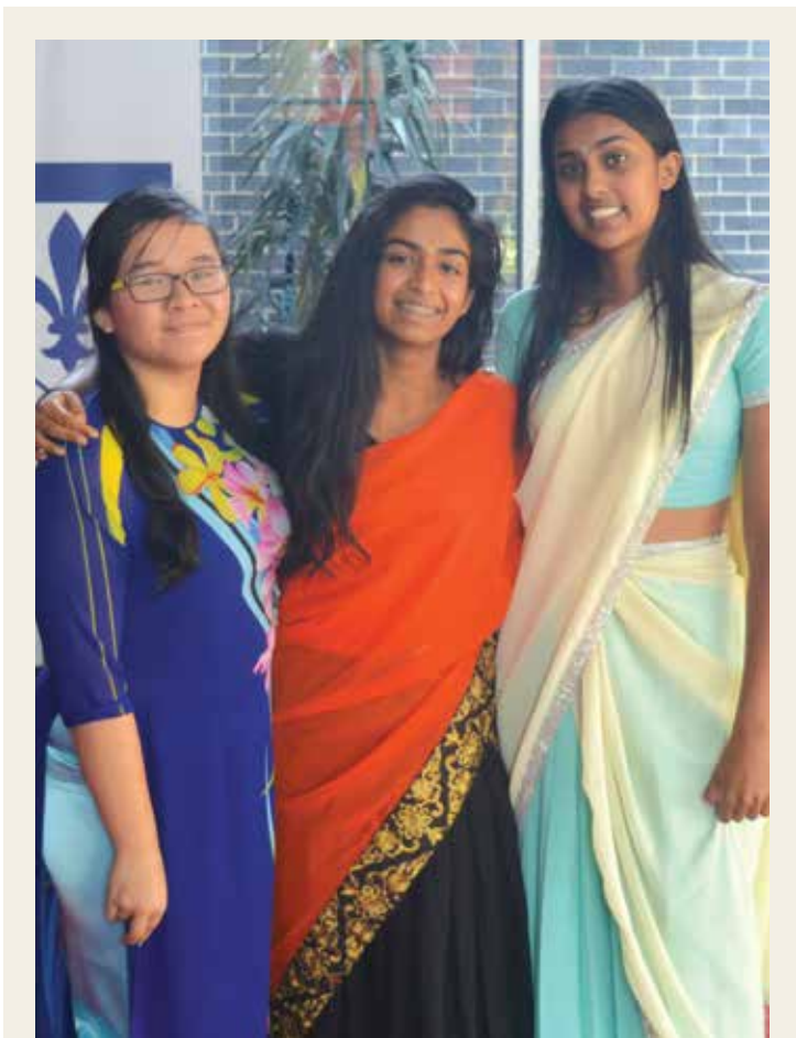
International Week, held from 8 – 12 May, sees many activities arranged and presented by students to celebrate cultural diversity within our community.