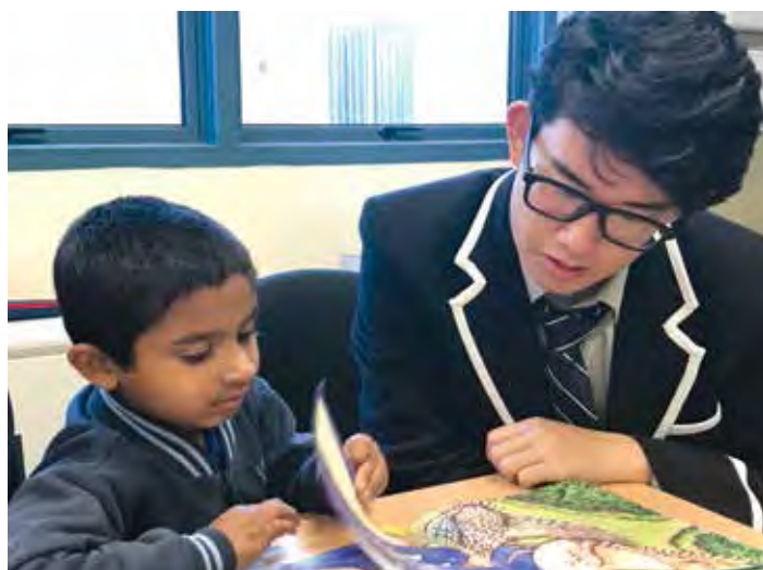
Students from Wheeler's Hill Campus regularly tutor children seeking asylum in Australia.