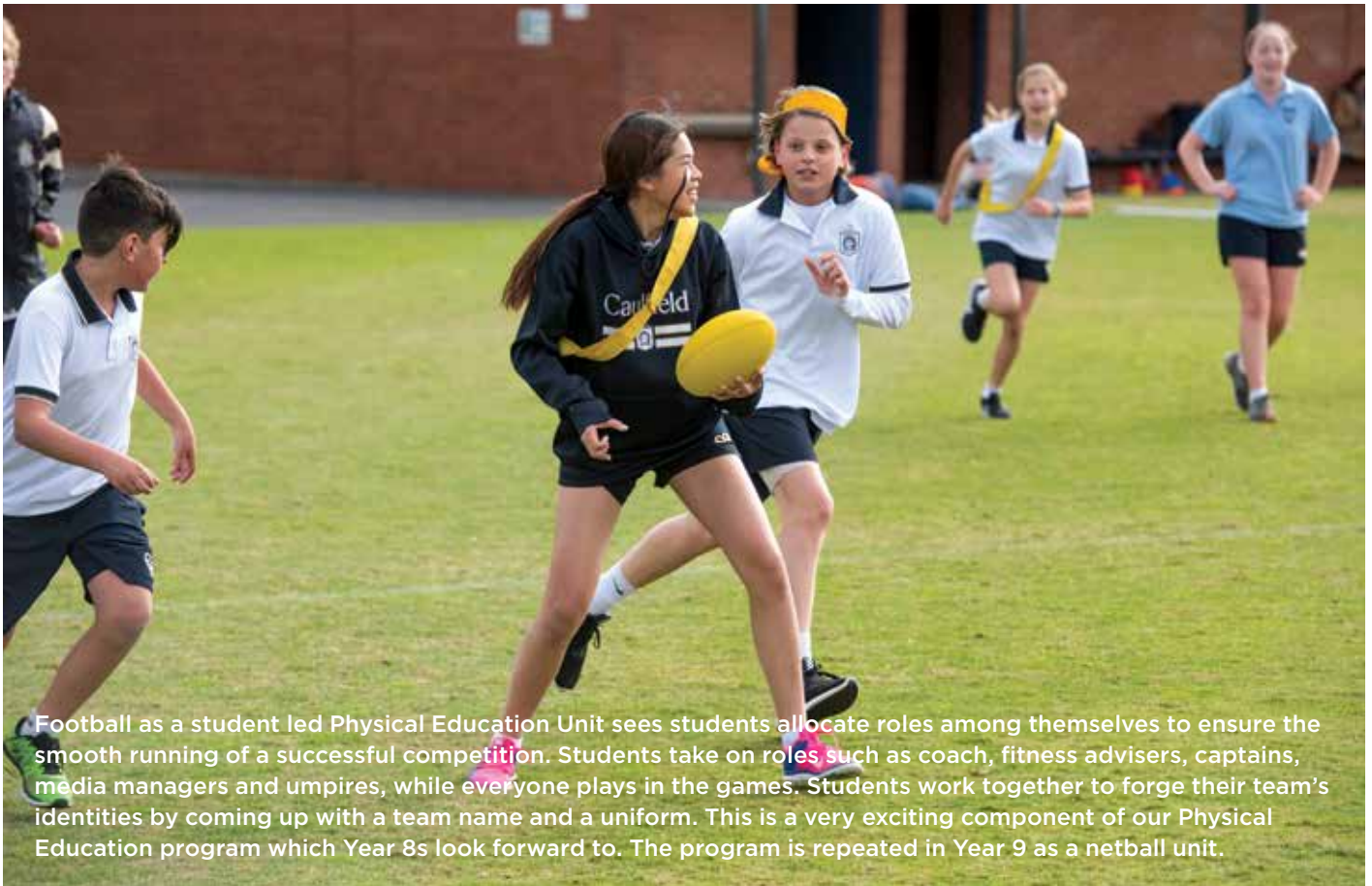
Football as a student led Physical Education Unit sees students allocate roles among themselves to ensure the smooth running of a successful competition. Students take on roles such as coach, fitness advisers, captains, media managers and umpires, while everyone plays in the games. Students work together to forge their team's identities by coming up with a team name and a uniform. This is a very exciting component of our Physical Education program which Year 8s look forward to. The program is repeated in Year 9 as a netball unit.