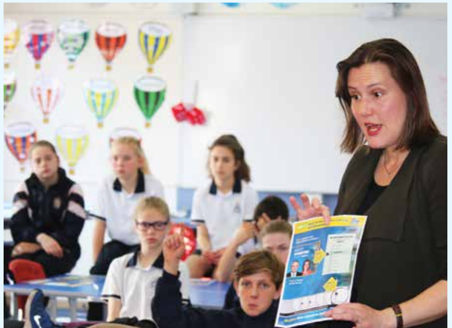
For our Year 6 learners at Malvern Campus, who were investigating democracy, a visit by Federal Minister, Kelly O'Dwyer MP, on 14 June helped set the scene for some interesting discussions. Minister O'Dwyer explained the houses of parliament and the process for introducing or changing legislation.